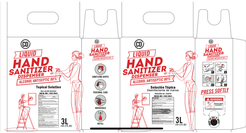
New Package Design Above